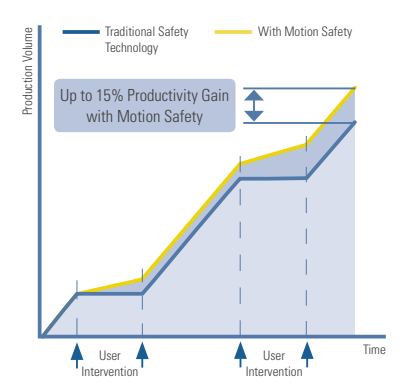
Productivity gain with Motion Safety: Machine zones that pose no risk to the operator remain running.

Specifications are subject to change without notice. It is the responsibility of the product user to determine the suitability of this product for a specific application. All trademarks are the property of their respective owners.