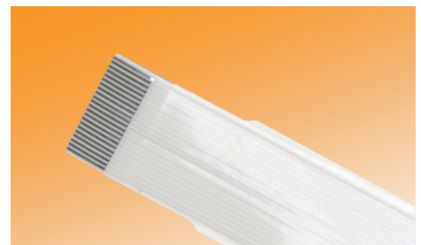
Parlex custom length cables offer multiple spacing, wide range of conductor counts, and a variety of termination and locking options

For more information, contact us at sales@johnsonelectric.com www.johnsonelectric.com