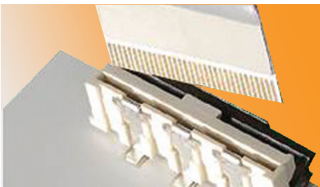
Ease of assembly